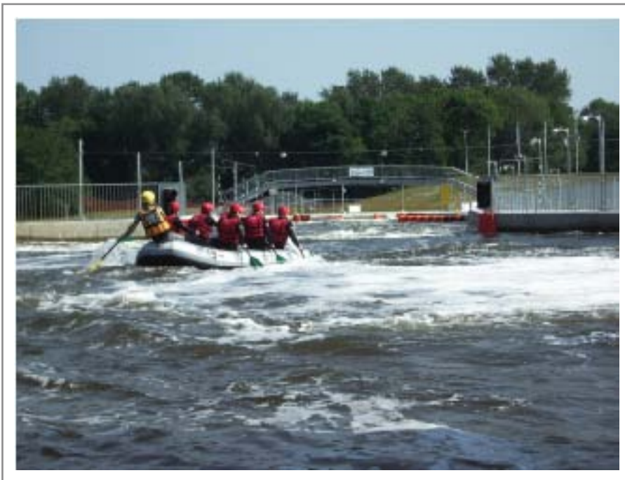
Dutch Water Dreams Site

The greatest benefit of the RTLS enabled visitor tracking and video system to Dutch Water Dreams is the added value it provides to customers who visit the complex. It is fun and besides that, the customers can improve their skills by watching their recorded rides. With this solution Mieloo & Alexander demonstrated the ability to combine and leverage various technologies such as RFID, digital video and video tracking software in order to achieve business value.