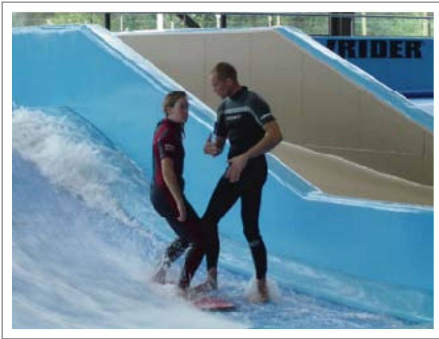
Dutch Water Dreams Site

This project was initiated by KPN who contracted Mieloo & Alexander to deliver this RTLS enabled visitor tracking and video system at Dutch Water Dreams.