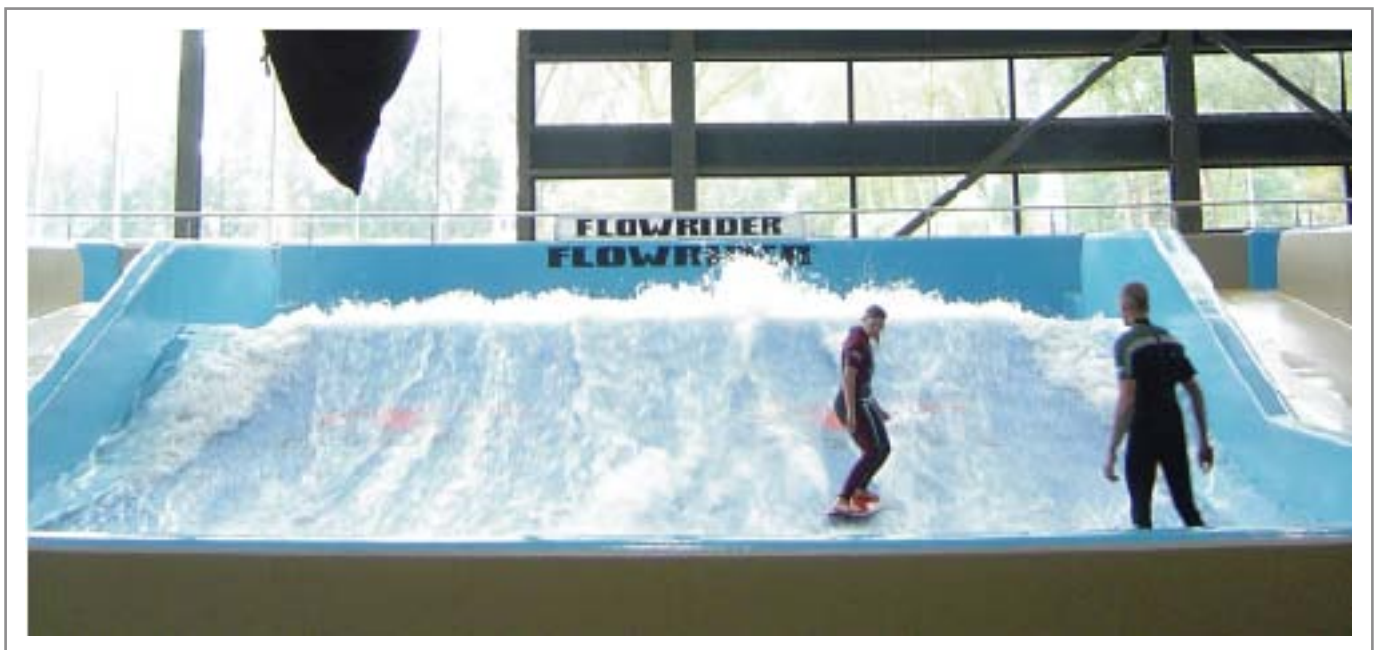
Dutch Water Dreams site

At Dutch Water Dreams, a unique Olympic-level white water sports complex in The Netherlands - Europe, an RTLS enabled visitor tracking and video system has been implemented. This solution identifies and locates visitors of this sports complex and makes personalized films of the visitors in specific action zones. Mieloo & Alexander was responsible for implementing this solution. Since the environment is high demanding (both indoor and outdoor with high levels of humidity, water, snow and high and low temperatures) Mieloo & Alexander selected a proven technology: Real Time Locating System (RTLS). This RTLS system enables accurate localization of the visitors in the specific areas where video footage of their actions are made. These films are of great benefit to both Dutch Water Dreams and the visitor: it is fun and besides that, the customers can improve their skills by watching their recorded rides.