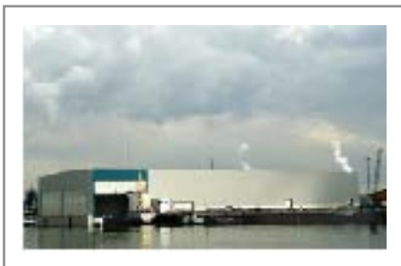
All Weather Terminal

Gevelco Logistic Services has four divisions which provide logistic services and concepts tailored to the requirements of their customers. The division described in this case is the Gevelco Distriport. The Distriport main services are: handling, storage and shipping of iron, steel, forest products and containers.