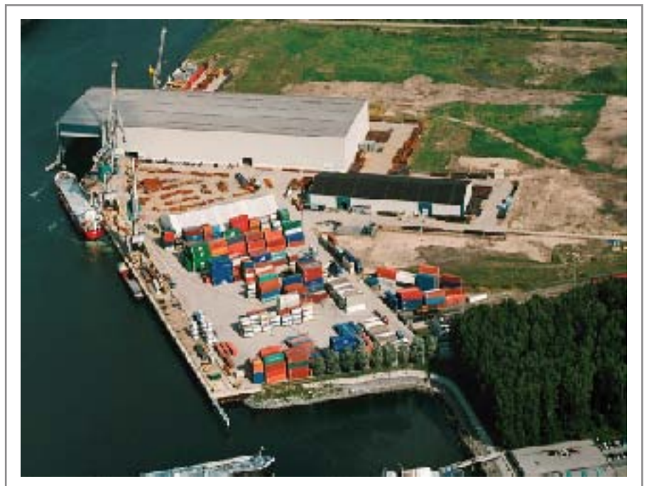
Overview of Gevelco Distriport

The main challenge for Mieloo & Alexander was to execute the assignment in just 8 weeks knowing that the management team and employees were very busy managing the operation. Also there was very little documentation to start with.