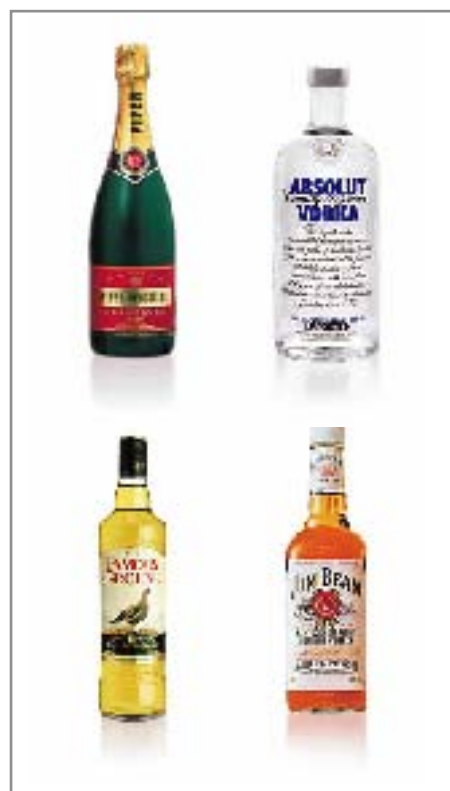
Brands of Maxxium

Maxxium Worldwide is responsible for the sales, local marketing and distribution of many of the world's premium spirits and wine brands, including ABSOLUT Vodka, The Famous Grouse Scotch Whisky, Jim Beam Bourbon and Rémy Martin Cognac. Maxxium is owned by four equal shareholders, The Edrington Group, Beam Global Spirits & Wine, Rémy Cointreau and the V&S Group. (see: www.maxxium.com ).